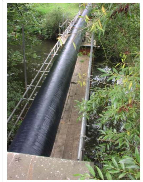
Pipe Wrapping Completed

The Company operates a quality system and is accredited to ISO9001 via NQA: