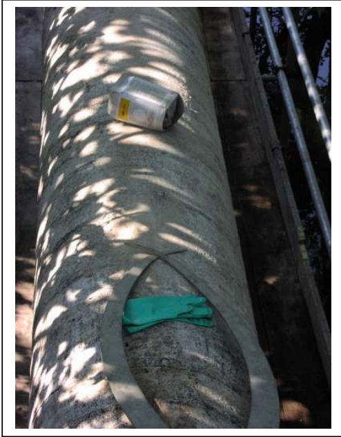
Pipe Preparation for Coating

The pipe coating service includes project management, risk assessment and method statement preparation, liaison between local authorities, landowners and the Environment Agency.