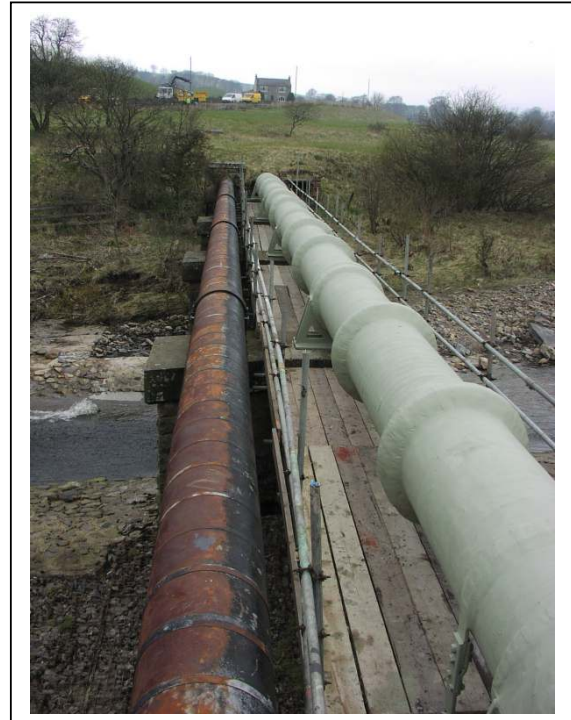
Typical Pipe Coating (RHS Pipe Wrapped) - Potable Water Trunk Main

Pipelines or pipe work in steel, grey cast iron or ductile iron can be re-coated to our standard specification or to customer specification as required.