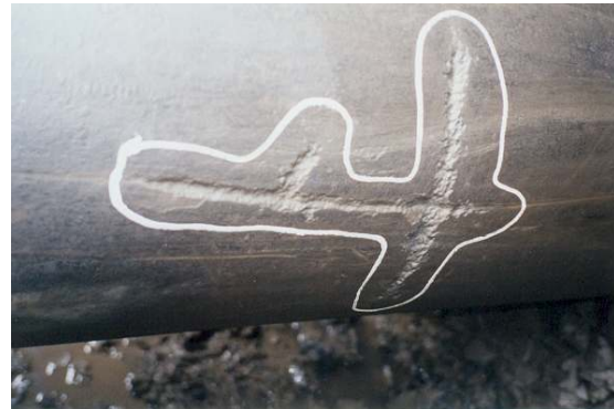
Photograph 2 - Defect Identification

Photograph 2 below shows the identified external defect in what was otherwise thought to be a clean and sound pipe as seen in Photograph 1.