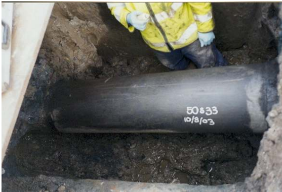
Photograph 1 - Pre-scanned Pipe

AESL assessment tools use magnetic flux technology to characterise both internal and external defects in metallic pipework. The assessment tool technology allows assessment of the full pipe wall thickness along the inspected main.